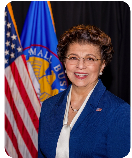
Administrator Jovita Carranza

Upon a request received from a state's or territory's Governor, SBA will issue under its own authority, as provide by the Coronavirus Preparedness and Response Supplement Appropriations Act that was recently signed by the President, an Economic Injury Disaster Loan declaration.